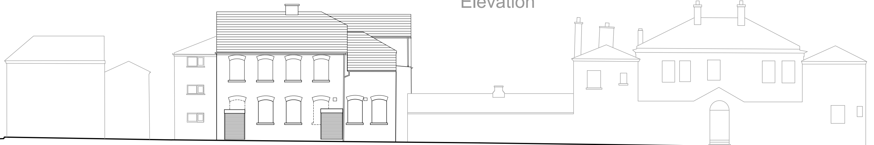
Rear / North Elevation